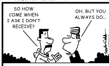
17TH SUNDAY IN ORDINARY TIME

Support Your Fire Department — Two fire departments that protect our parish properties will be having their major fundraisers of the year in the next couple of weeks. Please support them! The Random Lake Fire Department will hold its annual Picnic on Fri., July 23 - Sun., July 25, at the Random Lake Firefighter’s Park. The Cascade Fire Department will hold its annual Picnic on Fri., July 30, - Sun., Aug. 2, at Memorial Park in Cascade.